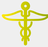
Medical Materials & Devices