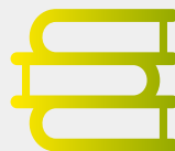
Books and Journals